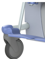
Swivel castor with individual brake