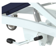
Hydraulic control pedal.

Unlike the Marina Deluxe, this basic model does not have a backrest. This model has four swivel castors with individual brakes, making it easier to use and maintain. The Marina Basic is available with hydraulic or electric height adjustment and is equipped with folding side rails for safe and comfortable care. An ideal solution for healthcare institutions looking for functionality, reliability and ease of use.