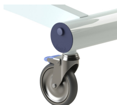
Swivel castor with individual brake.