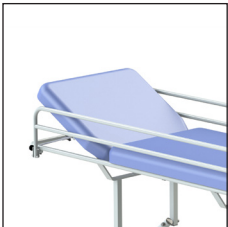
Adjustable backrest (Vienna 4025, Vienna Deluxe 5030)