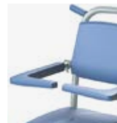
Independent, fold-up upholstered armrests with front lock.