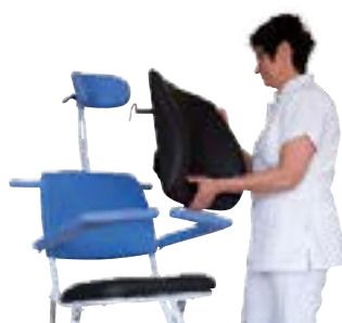
6950 5624 / 6950 5625 Platilon backrest / Platilon seat