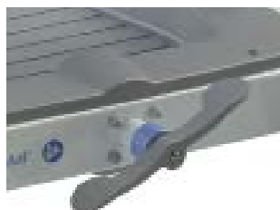
Mechanical base spreading.