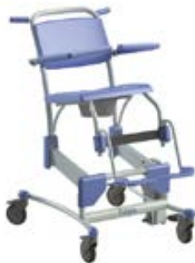
5100 5199 Flexo Shower-Toilet Chair