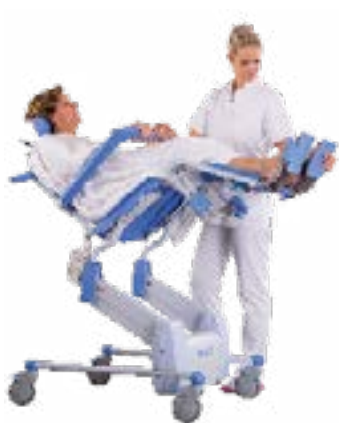
Option: Adjustable comfort leg supports (Product no. 6960 8026).