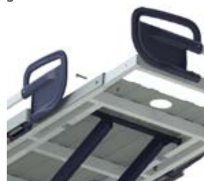
With a standard built-in length adjustment (Sirocco basic & deluxe)