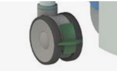
Fitted with a directional wheel.