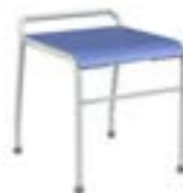
5400 6005 Timo Shower Stool