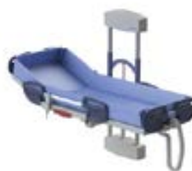
6100 2510 Sirocco deluxe Shower Stretcher Wall-mounted