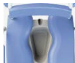
Two parted seat with front and back openings. Easy removable snaplock seat.