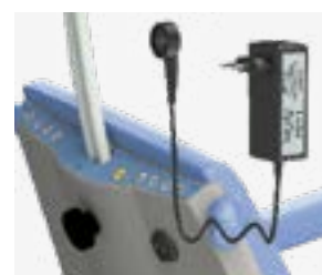
Charging point with magnetic coupling, no separate battery required.