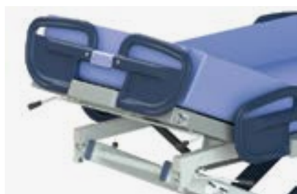
Electric or by means of a gas spring back adjustment (Marina deluxe).