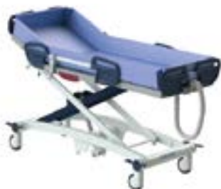
6100 2060 Marina deluxe electric Shower Trolley height adjustment