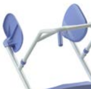
Rotating seat parts.