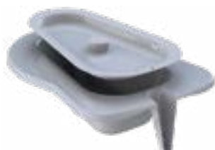
6950 1104 Commode pan and lid