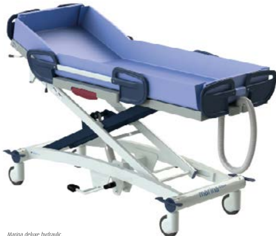
Marina deluxe hydraulic.