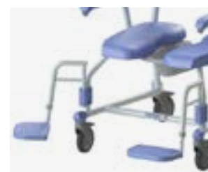
Swing-out and removable footrests. Height adjustable.