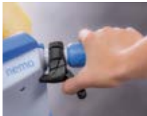
Control handle for tilting system.