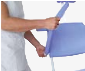
Independent, fold-up upholstered armrests with front lock.