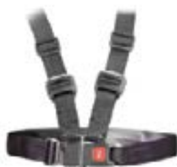
6975 8045 Four point safety belt