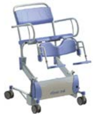
5100 5300 Elexo XXL Shower-Toilet Chair