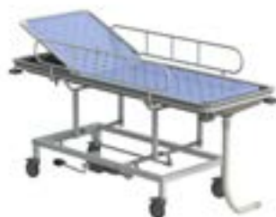
6100 3070 Stylex hydraulic Shower Trolley