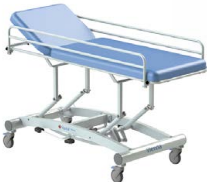
6500 4025 Vienna hydraulic Dressing Table