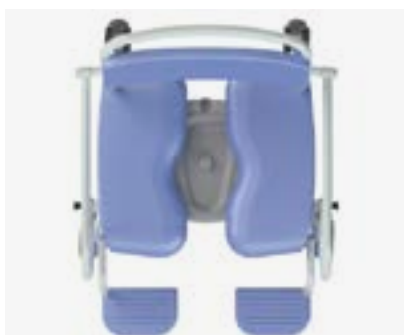
Two parted seat with front and back openings. Easy removable snaplock seat.