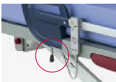
Angled position (Anti-Trendelenburg) (Marina deluxe & basic).