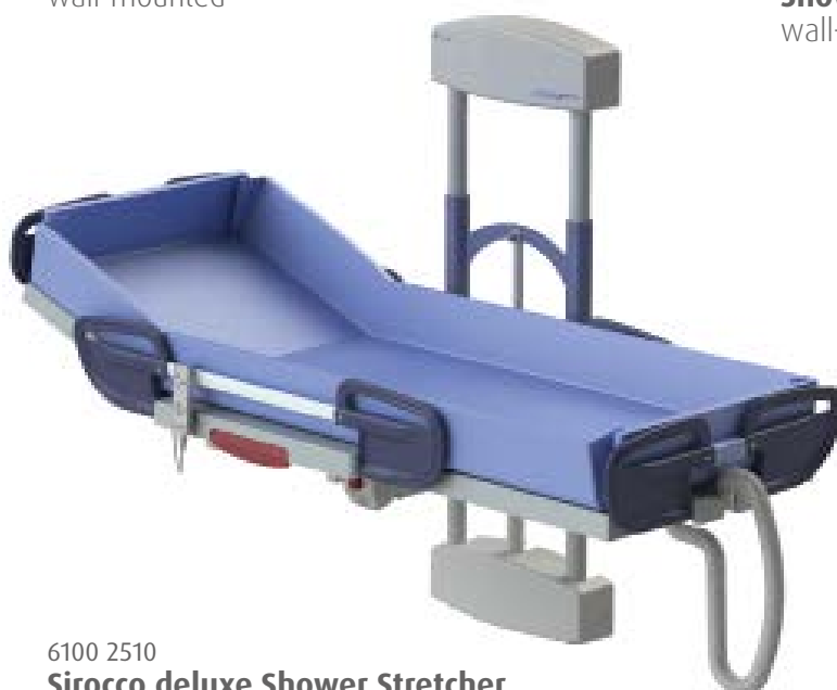
6100 2510 Sirocco deluxe Shower Stretcher wall-mounted