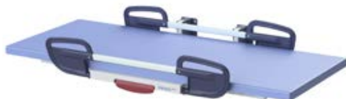
6500 5035 Vienna basic wall-mounted fixed height Dressing Table