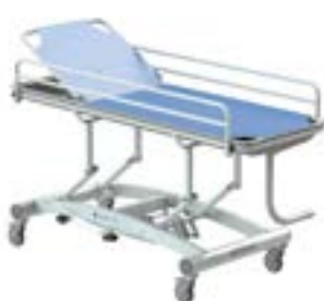
6200 4015 Amfora hydraulic Shower Trolley