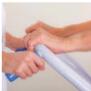
Variable contact points.