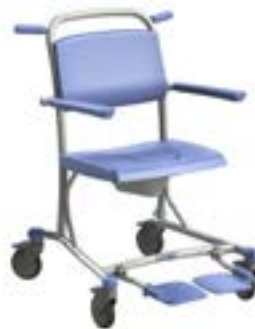
5100 5700 Tango Shower-Toilet Chair