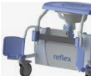
Foldable and swing-out footrests.