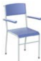
5400 6020 Timo 6020 Shower Chair