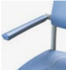
Option: Straight armrests.