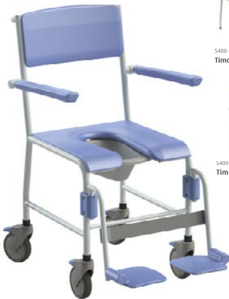
5400 6035 Timo 6035 Shower-Toilet Chair + footrests

All measurements in this matrix are in centimeters.