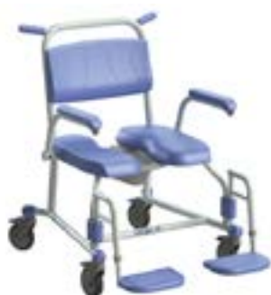
5100 5705 Tango XL Shower-Toilet Chair

For instruction and demonstration go to: www.lopital.com/videos