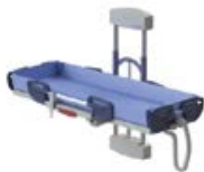
6100 2500 Sirocco basic Shower Stretcher Wall-mounted