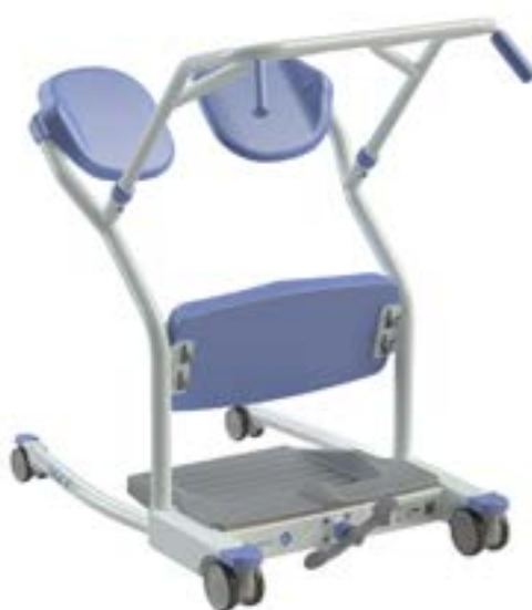
5900 8270 Lotus XL