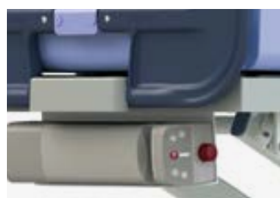
Control box emergency stop (Marina deluxe & basic electric).