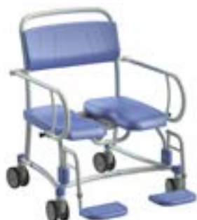
5100 5800 Tango XXL Shower-Toilet Chair