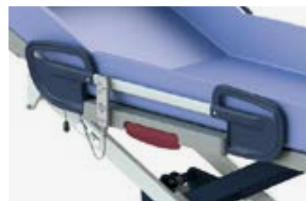
Side rail with lowered middle section for providing optimum care (Marina deluxe & basic).