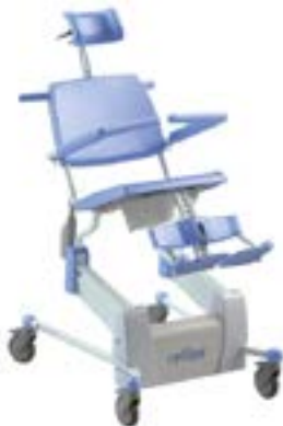
5100 5600 Reflex 5600 Shower-Toilet Chair with height adjustable footrests