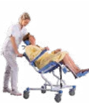
Tilting function up to 30° backwards.