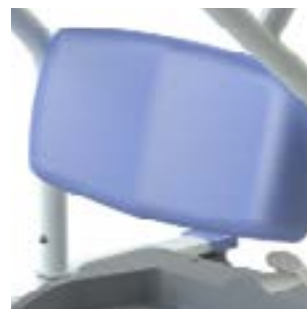
Comfortable lower leg support.