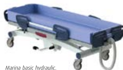
Marina basic hydraulic.