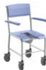
5400 6030 Timo 6030 Shower-Toilet Chair