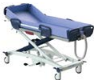
6100 2010 Marina deluxe hydraulic Shower Trolley height adjustment