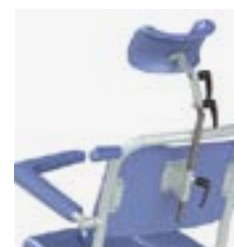
Option: Head / neck support.