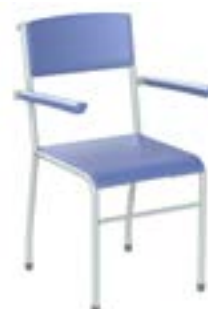
5400 6020 Timo 6020 Shower Chair