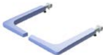
6840 5661 Dual locking armrests