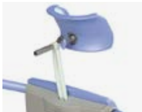
Standard equipped with a head / neck support. Adjustable in height and depth.