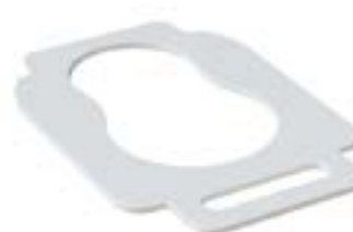
6950 1110 Holder for disposable bedpan