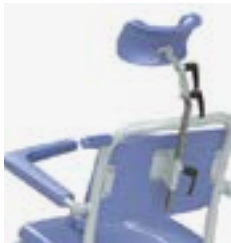
Option: Head / neck support.