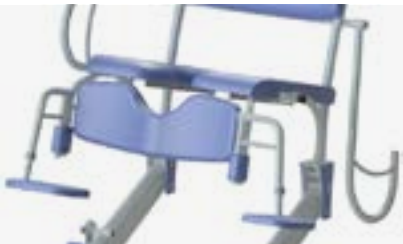
Swing-out and removable footrests. Height adjustable. Extended fully swing-out armrests.