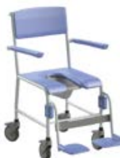
5400 6035 Timo 6035 Shower-Toilet Chair + footrests