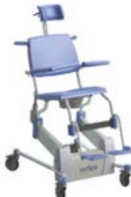
5100 5605 Reflex 5605 Shower-Toilet Chair