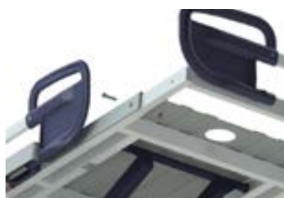
With a standard built-in length adjustment (Marina deluxe & basic).