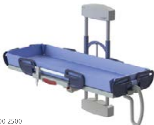
6100 2500 Sirocco basic Shower Stretcher wall-mounted

All measurements in this matrix are in centimeters.