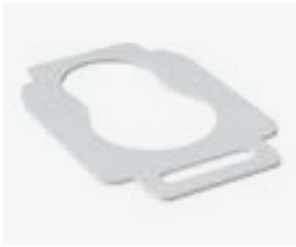
Option: Holder disposable Bedpan (Product no. 6950 1110).