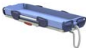
6100 2505 Sirocco basic fixed height Shower Stretcher Wall-mounted