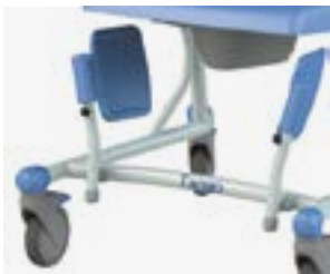
Foldable and swing-out footrests.