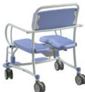
Suitable for obese clients up to 800 lbs / 360 kg.