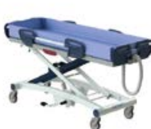
6100 2000 Marina basic hydraulic Shower Trolley height adjustment