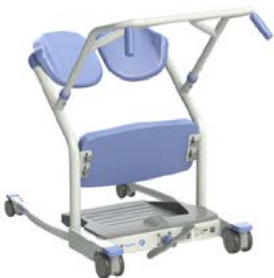
5900 8250 Lotus compact