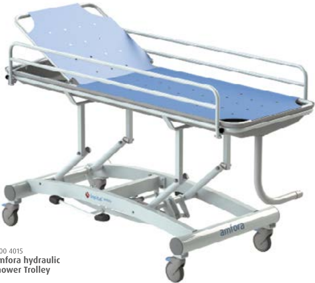
6200 4015 Amfora hydraulic Shower Trolley