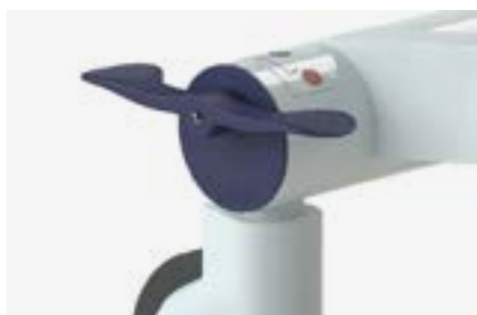
Half-central braking system (Marina deluxe).