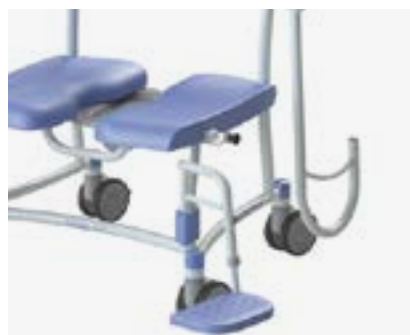
Swing-out and removable footrests. Height adjustable. Extended fully swing-out armrests.