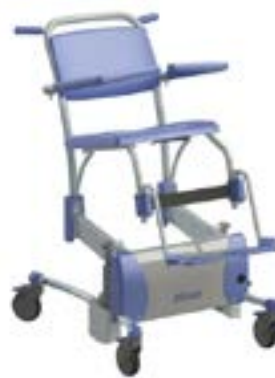
5100 5500 Elexo Shower-Toilet Chair