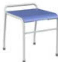
5400 6005 Timo Shower Stool