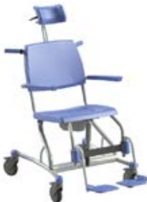
5100 5100 Nemo Shower-Toilet Chair

For instruction and demonstration go to: www.lopital.com/videos