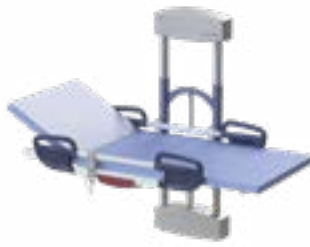
6500 5030 Vienna deluxe wall- mounted Dressing Table Wall-mounted