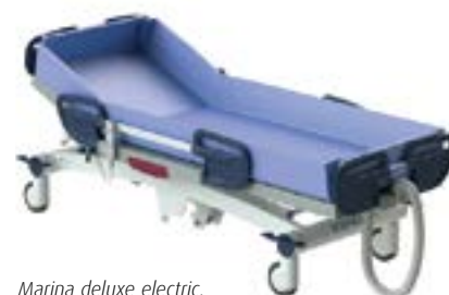
Marina deluxe electric.