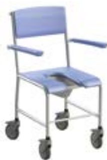
5400 6030 Timo 6030 Shower-Toilet Chair