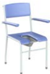
5400 6021 Timo 6021 Shower-Toilet Chair