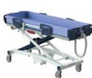
6100 2050 Marina basic electric Shower Trolley height adjustment