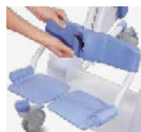
With height adjustable footrests.