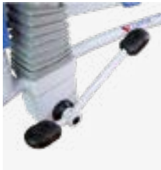
High / low control by foot pump.