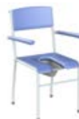
5400 6021 Timo 6021 Shower-Toilet Chair