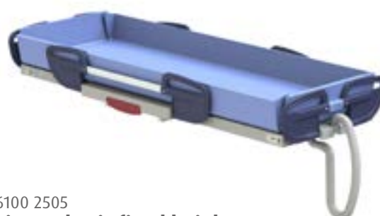
6100 2505 Sirocco basic fixed height Shower Stretcher wall-mounted