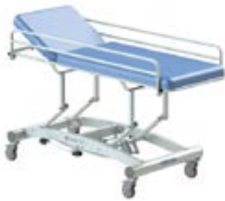
6500 4025 Vienna hydraulic Dressingtable