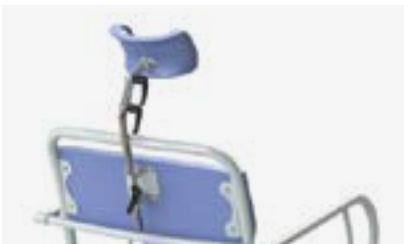
Option: Head / neck support.