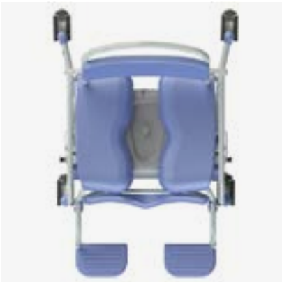
Two parted seat with front and back openings. Easy removable snaplock seat.