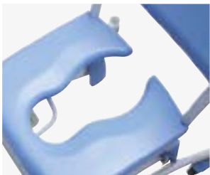
PU seat with toilet opening.