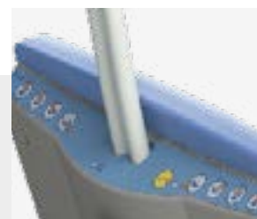
Easy-to-use touch controls in the backrest.