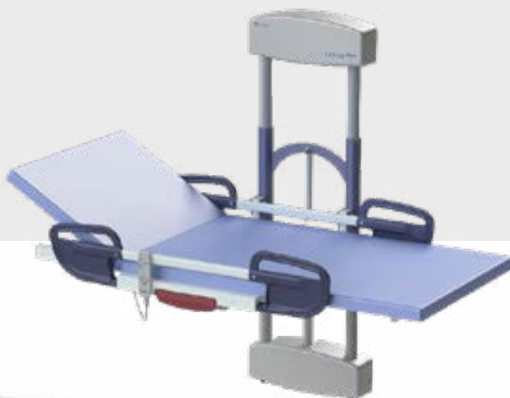
6500 5030 Vienna Dressing Table Wall-mounted