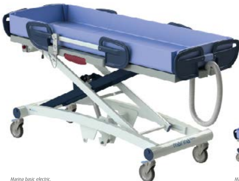
Marina basic electric.

Light, comfortable and versatile in use.