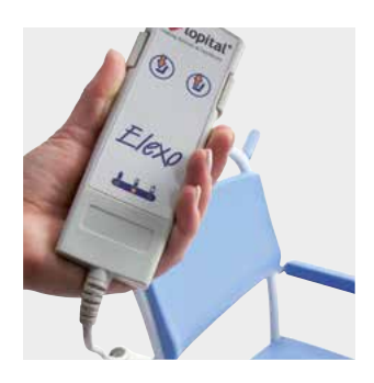
Hand control with battery indicator.