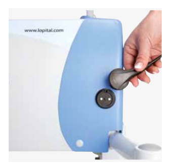
Charging point with magnetic coupling.