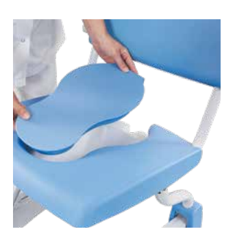
Ergonomically formed seat with inlay.