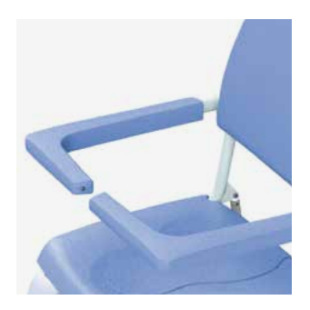
Independent, foldable upholstered armrests with front lock.