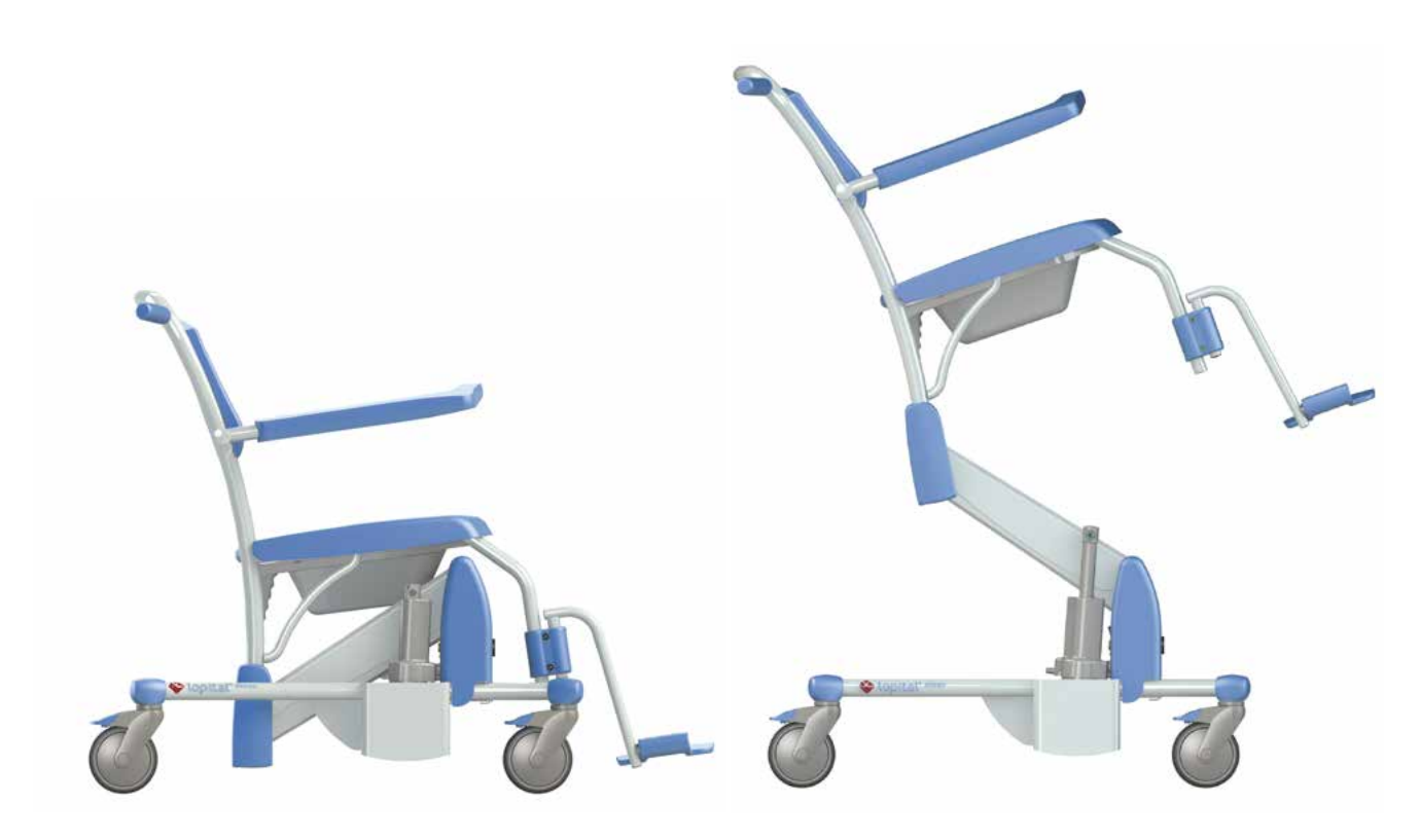
Seat height in lowest position 50 cm.